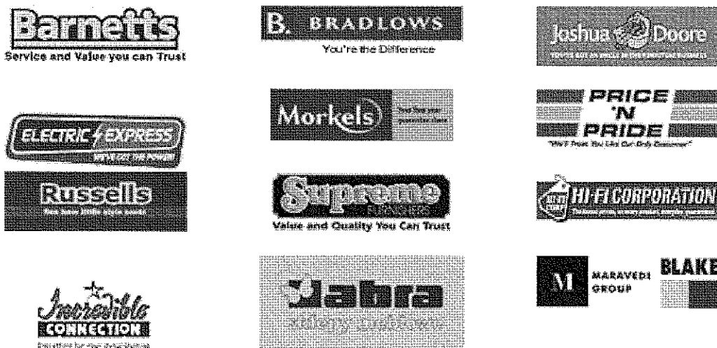
Some of the acquiring firm's brands 5

[9] The JD Group is a diversified retailer in furniture, appliance, electronics and technology good, home entertainment, office automation and financial services. The JD Group trades throughout South Africa through entities such as Barnetts, Bradlows, Electric Express, Joshua Doore, Price 'n Pride, Morkels, Russels, Hi-Fi Corporation, Incredible Connection and JD Micro Life Limited. The JD Group also owns "Supreme Stores" in Botswana, and shares in Abra, a furniture retailer in Poland. 4