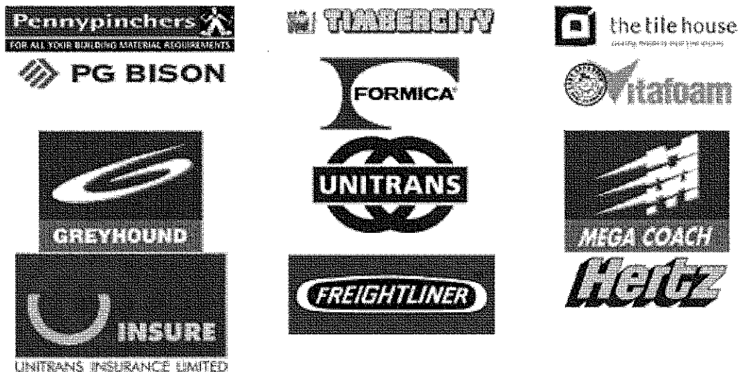
Some of the target firms' brands 6

[11] Unitrans, the second primary target firm, sells new and used Toyota, Volkswagen, Audi, Fuso, Mercedes Benz, Mitsubishi, Opel, Nissan, Renault, Hino, Dodge, Chrysler, Jeep, Mini, MAN, BMW, Lexus, Isuzu, Cadillac, Chevrolet and Freightliner vehicles through its franchised dealerships located throughout South Africa. Unitrans also provides motor body shop services and driveway services, parts and accessories. Unitrans Automotive offers finance to individuals and corporate clients for new and used vehicles through all major financial institutions and Unitrans Insurance offers short term insurance services to Unitrans customers.